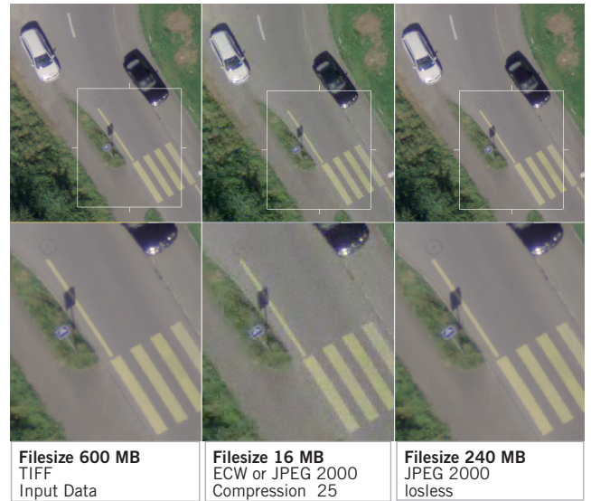
Only at high compression rates (middle) and even so only at the enlargement (middle below) some image noise is noticeable.

ECW has become the de facto industry standard for rapidly handling large geospatial imagery.